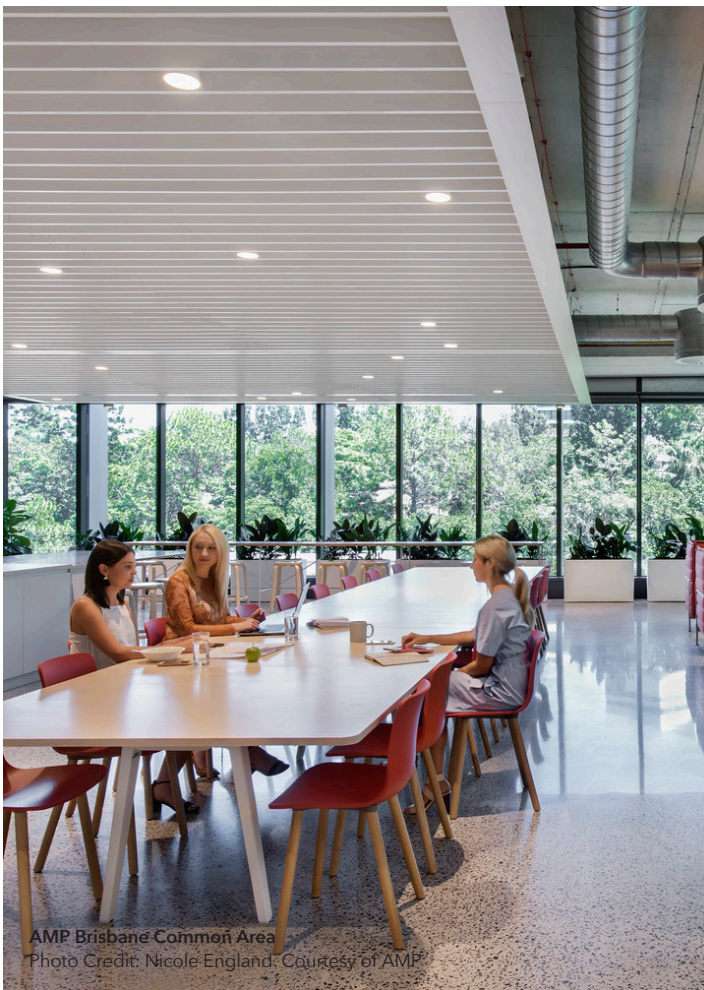
AMP Brisbane Common Area

After making upgrades to the stairs in the Circular Quay office, AMP has seen a significant uptake in use, with